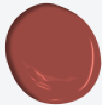
FRONT DOOR BENJAMIN MOORE SPANISH RED CC-92