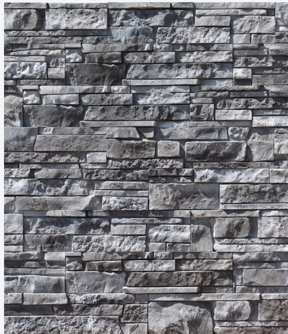
GARAGE, GUTTERS, DOWNSPOUT BENJAMIN MOORE WATER'S EDGE