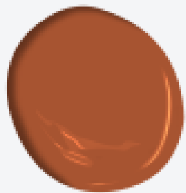
FRONT DOOR BENJAMIN MOORE AZTEC BRICK 2175-10